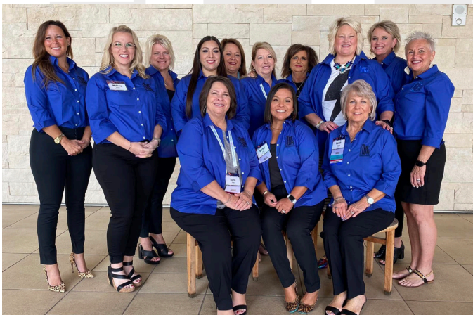
TREWA Board and Volunteers

It seems like yesterday we were gathering at the Gaylord Texan Resort in Grapevine, Texas for the 2022 TEC/TREWA Annual Meeting. That was August and here we are already into the month of November. Thanksgiving and Christmas are upon us.